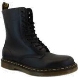
Dr Martins (or equivalent) boots