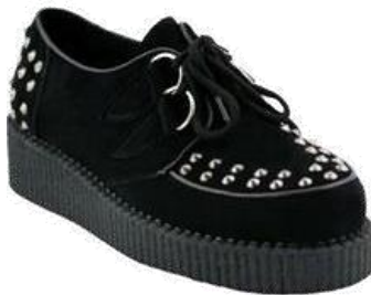
Suede studded shoes