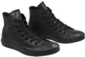
Converse (or equivalent) leather or canvas boot