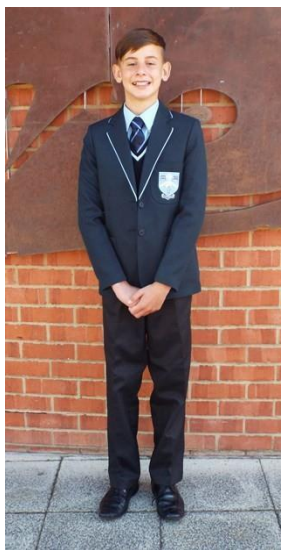
Boys uniform with optional jumper