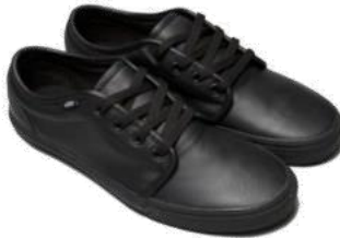
Vans (or equivalent) style leather or canvas trainer