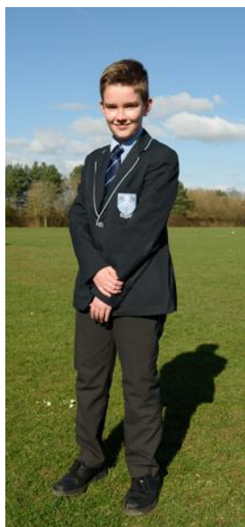
Boys uniform without jumper