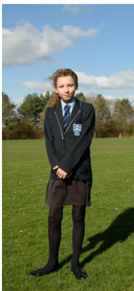
Girls uniform without optional jumper