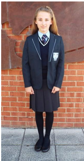
Girls uniform with skirt option and optional jumper

All students in Years 7–11 will be expected to wear the school uniform. The full list of items is outlined on the next page.