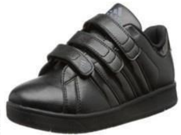
Adidas (or equivalent) leather trainers