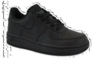
Nike (or other manufacturers) trainers