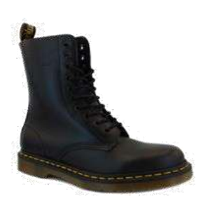
Dr Martins (or equivalent) boots