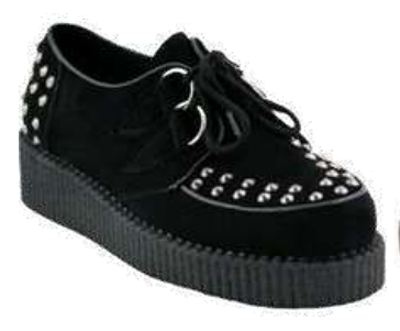
Suede studded shoes