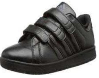
Adidas (or equivalent) leather trainers